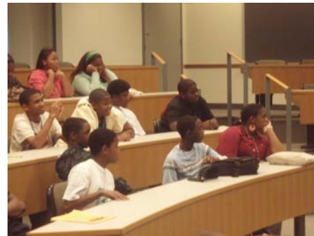
Students during Rites of Passage workshop.