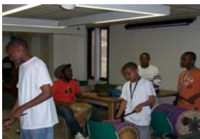
Drumming (above), Stepping (below)

Ase has collected $5500 to date, with more coming in. With this effort, the Board surpassed the initial $5000 goal, and set a great tone for next year's campaign.